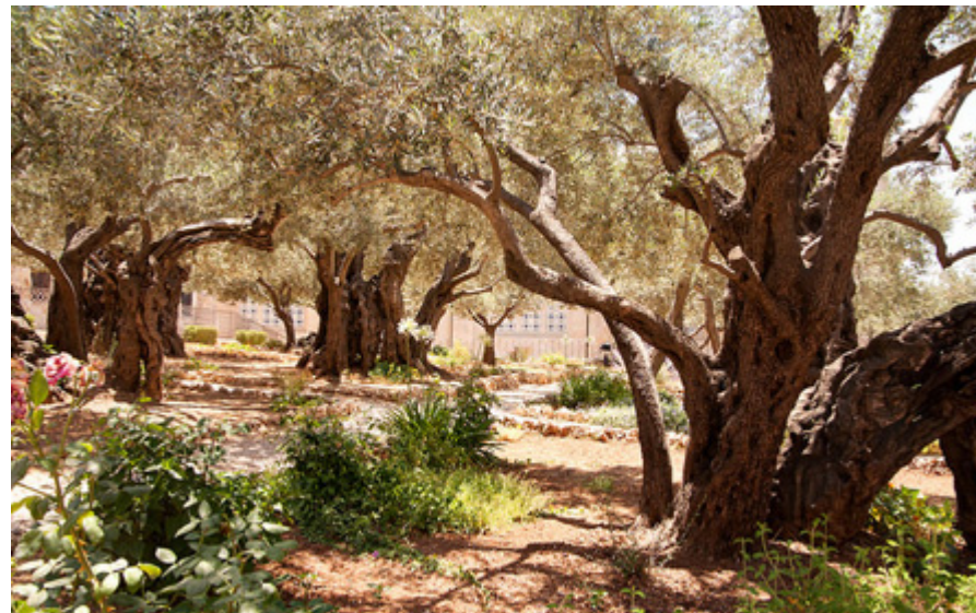
Garden of Gethsemane

http://www.facebook.com/StLeodegarsChurch