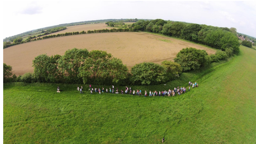
Rogation Sunday Walk 2014 nearing St Stephen's Church, North Mundham

TWITTER @StStephensNM http://www.facebook.com/StStephensNorthMundham http://www.facebook.com/StLeodegarsChurch